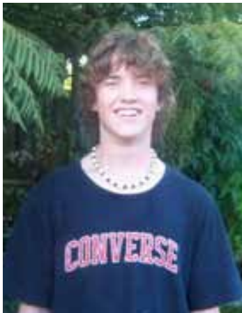
Anthony, New Zealand

Each one of these students are International Boy Scouts and may be available. There are others from countries around the world.